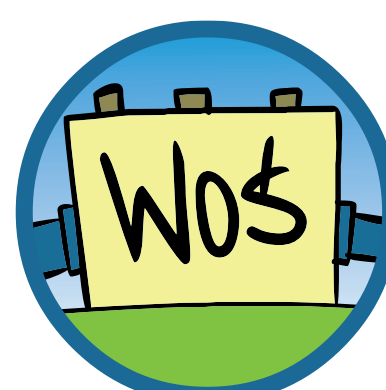
Dirty water reaches Wroclaw Sewage Treatment Plant