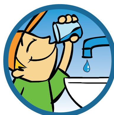
Drink tap water