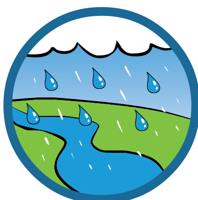
Rain feeds rivers