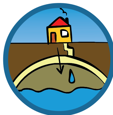
Dirty water from home to sewerage system