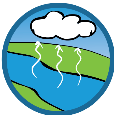
Evaporation to clouds