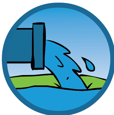
Once the dirty water has been purified - back into the river